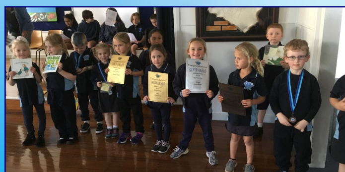
HOME READER AWARDS