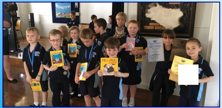
HOME READER AWARDS