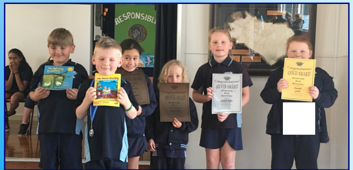
HOME READER AWARDS