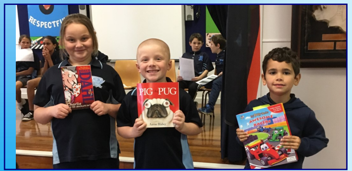
HOME READER AWARDS