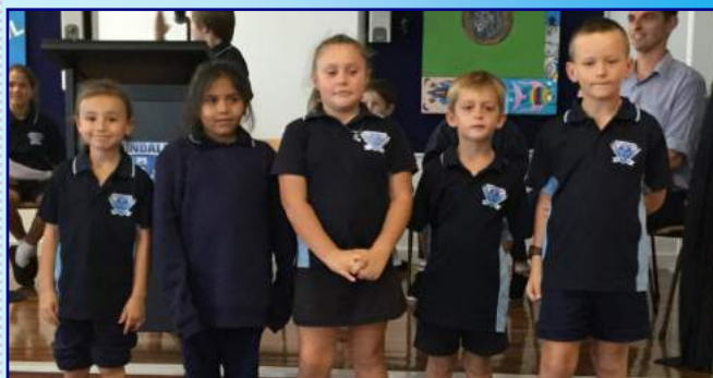
CLASS AWARD WINNERS