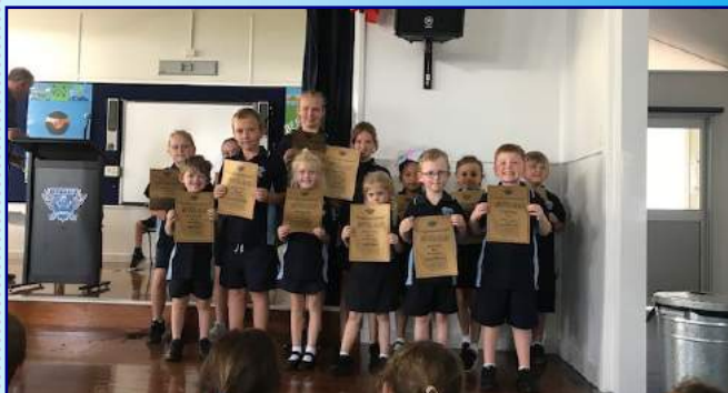
BRONZE HOME READING AWARD