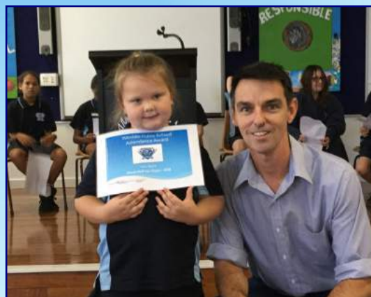
ATTENDANCE AWARD - KM