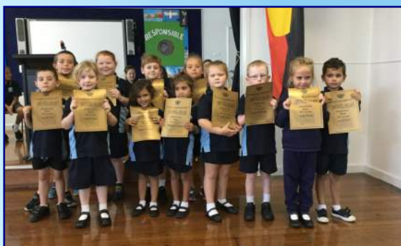
BRONZE HOME READING