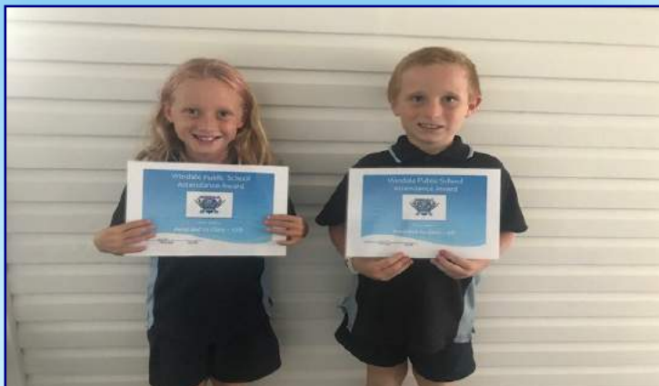
ATTENDANCE AWARDS 1/2S - 4H