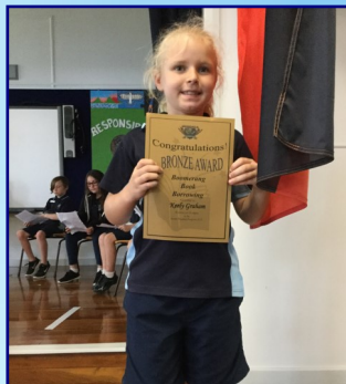
BOOMERANG BOOK BORROWING BRONZE AWARD