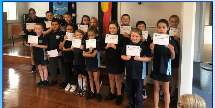
INFANT & PRIMARY AWARDS