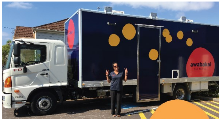
Windale Public School