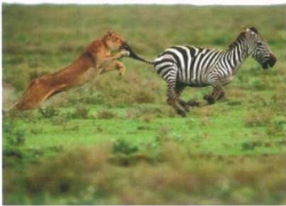
The lion chased the zebra.

The lion chased the zebra. Early in the morning the lion grabbed the first zebra with her jaws! The zebra ran like a cheater then a terbell of storm camel.