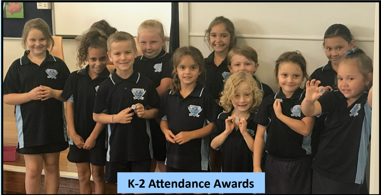
K-2 Attendance Awards

A BIG congratulations to all these students for having 98% or above attendance for Term 3.