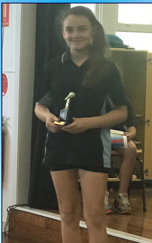
WINDALE'S GOT TALENT WINNER