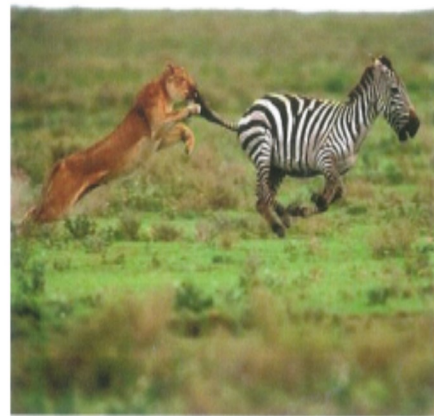
The lion chased the zebra.

The strong man mother lion tried to get the zebra at midhit to feed her cubs. The powerful lion lion jump on the zebra fast zebra and then the lion bit the zebra neck and then the lion bring the zebra to her cubs. The zebra digested digested and then they all pooped pooped the zebra out of there bottom then they went to sleep then at midhit the mother lion went went to go to the mother lion.