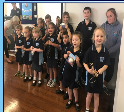
JUMP ROPE FOR HEART