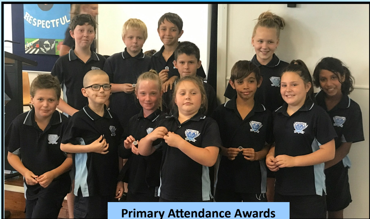
Primary Attendance Awards