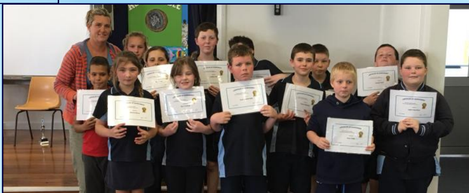
SWIMMING FOR SPORTS AWARDS